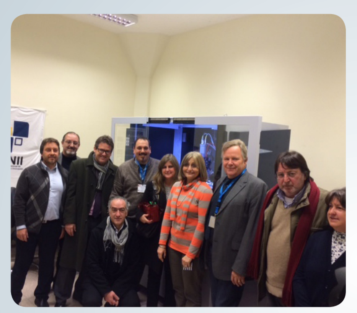
Attendees of the IYCR OpenLab in Uruguay in front of the newly installed D8 VENTURE